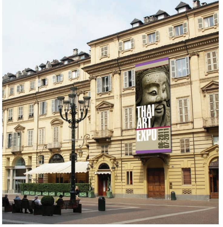
{\it Outdoor\ communication-reinforced\ vinyl}